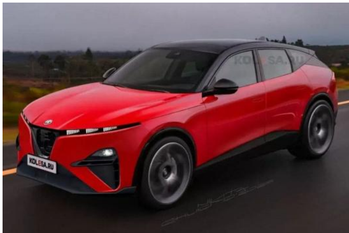
Artist's concept of the new Stelvio

Next-gen Alfa Romeo Stelvio delayed, but plug-in hybrid version with 380 hp engine expected to lead the range.