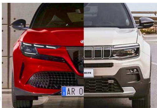
Alfa Junior vs Jeep Avenger

For the first half of 2025, year-over-year global sales of Alfa Romeo have increased by 20% overall, fueled primarily by the availability of the new Junior sub-compact