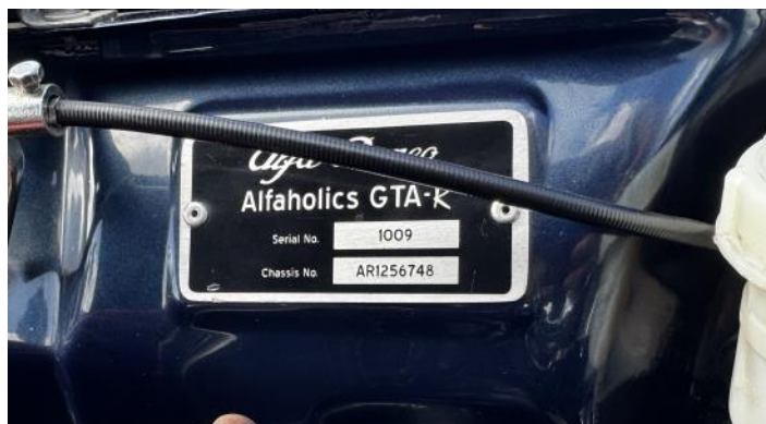
The GTA-R tipo plate from the Bonhams car

The “-R” builds are the top of the heap, the cars enthusiasts wait nine years for. “ Built from the chassis up using the finest materials and components, each GTA-R receives more than 3,500 hours of love and fastidious attention to detail, ” claims the company's website. They are “ ...the ultimate expression of performance, style, and desirability of the Alfa Romeo 105 series. ” The builds employ the range of parts from the Alfaholics performance catalog, which include titanium suspension and drivetrain components, and lightweight body panels. They are typically powered by injected twinspark engines modified to produce 240 hp. Pricing is variable but budgeting a half million or so would not be out of line.