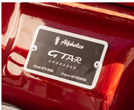
The “Upgraded” tipo plate

The car offered on BaT was originally a nicely restored red 1974 GTV purchased in February 2020 on BaT for $50,000. It was then shipped to the U.K for the full treatment.