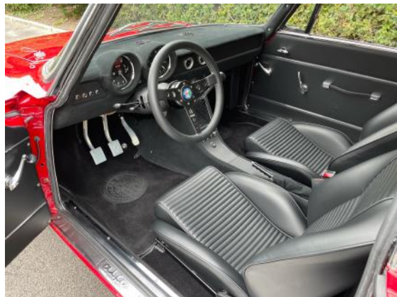
Upgraded or Remastered? 1974 GTA-R Spec Interior

Finally, you can send your car to Alfaholics for an “Upgrade.” Upgraded cars can be built up parts the owner selects from the catalog. It is unclear where the line is drawn between Remastered cars and Upgraded cars as the concept is similar. The BaT car was identified in the auction writeup as an Upgraded car and is so labeled, but the Alfaholics website identifies it as being a Remastered build. The turnaround time for the