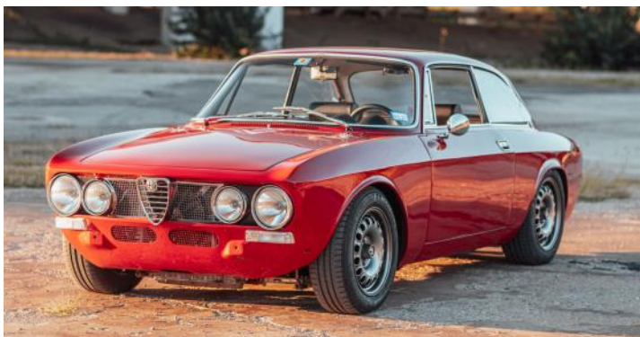
The Upgraded GTA-R spec 74 GTV

If that sounds like too much and you already own a GTV, Spider, or Super, Alfaholics will “Remaster” it for you. Just send your car to them. They will strip it down and rebuild it using parts from their catalog. They budget 1,700 hours of work for Remastered cars and the turn-around time is shorter.