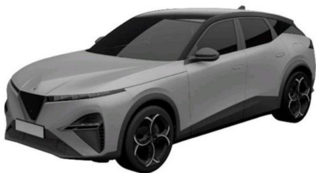
Patent filing illustration of the new Stelvio

The latest from Reuters is that the second-generation Stelvio will not begin production until fall 2026, with deliveries to begin in September or October. The delay is caused by the decision to add a hybrid version to the lineup. The new Stelvio was originally intended