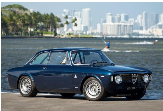
1971 GTA-R No. 009

Alfaholics stripped the car down to the painted shell and re-built it using roughly $300K worth of components. Some additional bodywork was required to correct dodgy restoration work. The 2-liter Nord engine was enlarged to 2.1 liters and received Jenvey fuel injection and a MoTeC engine management system. Lightweight components were employed throughout. Carbon Fiber Hood and trunk lids were installed. Air conditioning and custom upholstery was added. The car sold for $316,000 in November of 2022 and was offered two years later in October 2024 when it failed to sell at a high bid of $270,000.