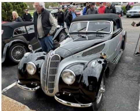
Frazer Nash assembled these BMWs under license in England prior to WWII.