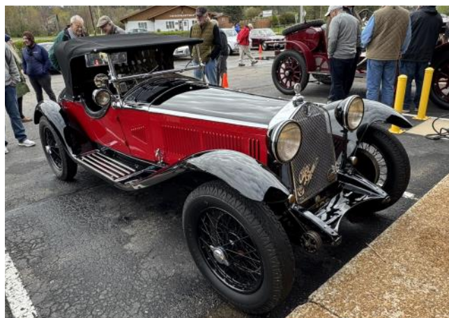
Denny Holloway's 1931 6C1750 Gran Sport