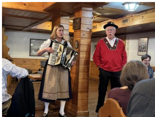
Yodeling for our dinner