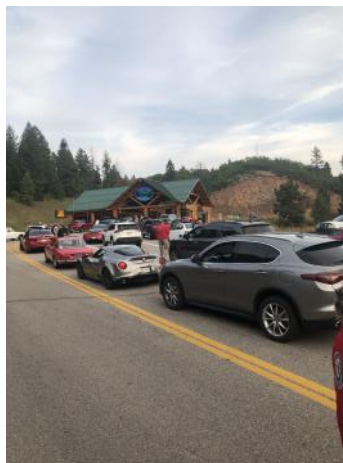
Toll booth traffic jam

contestants were split into randomly chosen teams of six. Spouses were encouraged to join separate teams. The rest was typical scavenger hunt fare, except that three pubs along our route were included for R&R.