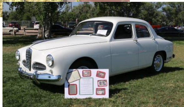
Rare anywhere but especially in the U.S., a 1900 T.I.