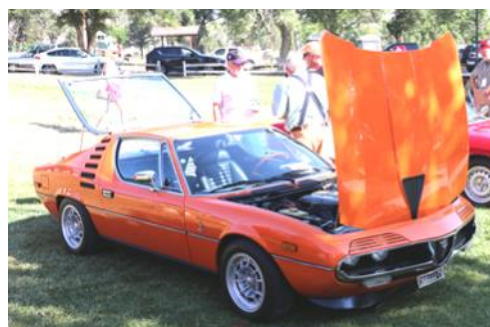
This might be the Montreal that Leno drove. I was unable to confirm.