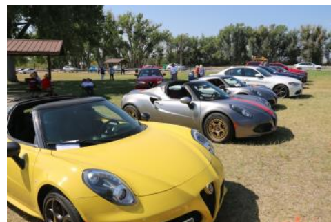
A small sample of the newer Alfas present.