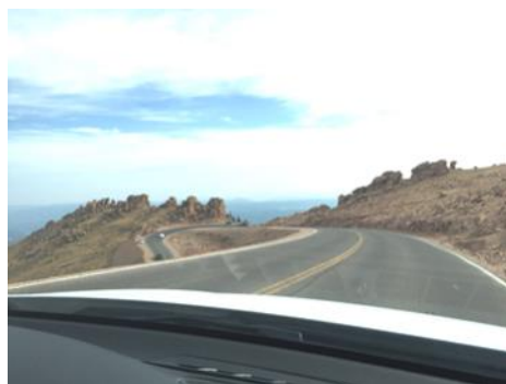
A typical Pikes Peak Switchback

The track day, pre-convention tours, tech sessions, and area tours received high marks from those who participated. The weather cooperated throughout the week, with cloudless though hazy