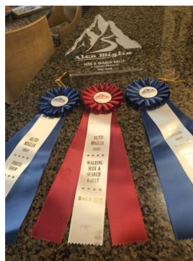
Your editors' awards haul. 1st in Rally, 1st and 2nd in walking rally, best race-track photo.