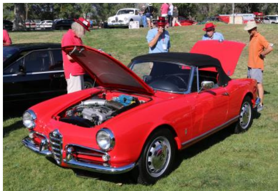
This Giulia Spider Veloce was immaculate and scored over 100 points in judging.