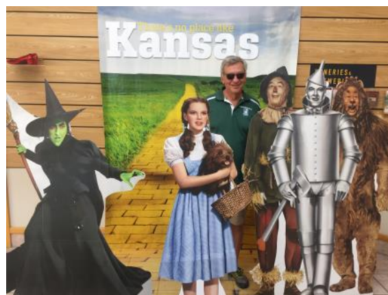
We met these people on the way home. Strange bunch.

When surveying the attendee-driven cars, it's apparent that modern Alfas have caught on in a big way. Giulias,