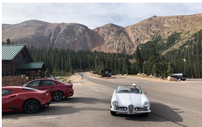
Cars of all ages drove Pikes Peak. This Giulietta from Illinois was also entered in the Concorso.

The Concorso was held in a town park about 15 minutes south of the convention hotel. There was a small field of cars entered for judging and a much larger contingent of area Alfisti who drove in to show their cars. The non-judged cars were parked in groups by era. Several of the judged cars were considered worthy of the Certificato d'Oro.