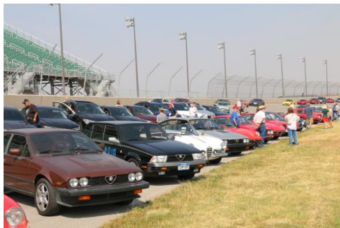
Alfas line up for a group photo at the raceway.

After a year off for Covid, Alto Miglia, the Colorado Springs AROC National Convention, came roaring back. All things considered, the convention organizers did a fabulous job. The challenges were many and of course pandemic related. Last summer's date was out of the question. An earlier 2021 date was ruled out for the same reason. Finally, the week of September 7-12 was firmed. Imagine having to juggle and reschedule event venues, VIP invitations, and service commitments not once but twice. Considering the logistics involved it's a miracle the event came off so smoothly. The membership responded by attending in substantial numbers, happy to be out in the fresh Colorado air.