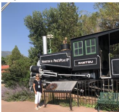
The rally required some photographic evidence.

All the usual convention events were offered. We participated in several. Your editors' favorites, the Gim-