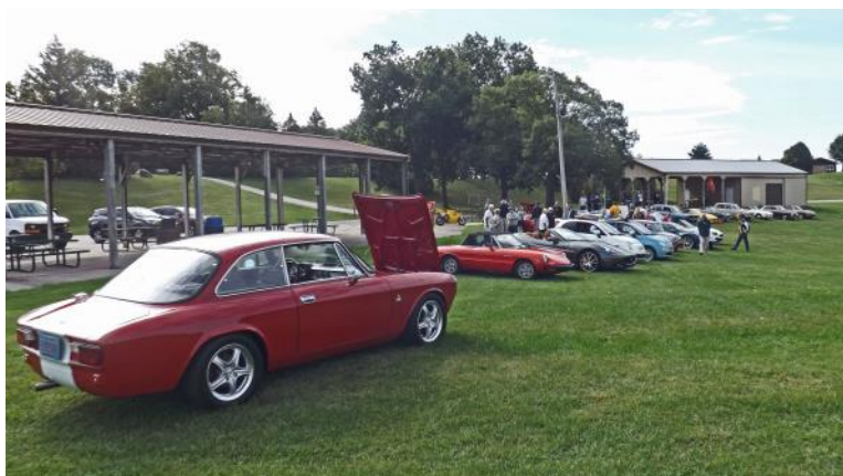
Another view of the field