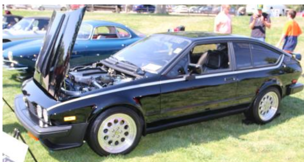
A very nice Callaway, the only one present