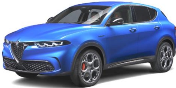
2023 Tonale Production Version

The Tonale is billed as the marque's first C-SUV and its first hybrid-electric offering, supplied in the U.S. as a PHEV, powered by a 1.3 liter turbo four augmented by a 90kW electric motor and 15.5kWh lithium battery. The combination provides a best-in-class 272 hp and an electric-only range of 30 miles. For those not wishing to plug their SUV into a wall socket, a 2.0 liter turbo four producing 256 hp with 295 lb.-ft. of torque will also be available.