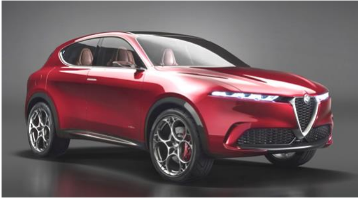
2019 Tonale Concept

The Tonale first appeared as a concept in 2019 and the production version is faithful to the original design in most respects. See the images below for a comparison.