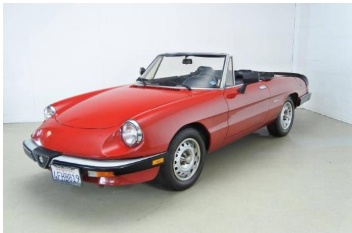
Hemmings' 1986 Spider Graduate.

Last year Hemmings Motor News launched an auction site. At its rollout, Hemmings promised to provide a better-curated offering of collector cars and well-screened buyers in a “high-touch” online environment.