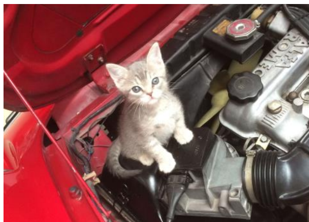
This kitten wasn’t included in the Spider sale.