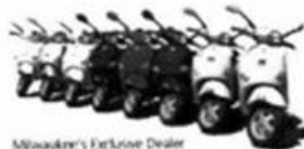
Milwaukee's Exclusive Dealer