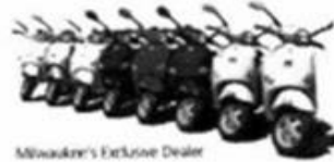
Milwaukee's Exclusive Dealer