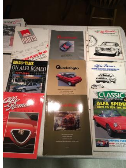
Three copies of the Quadrifoglio , Alfa's U.S. house organ, $30 for the lot