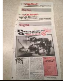
Several copies of the Performance Quarterly , published by Alfa Ricambi. Offers accepted.