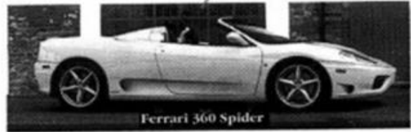
Ferrari 360 Spider