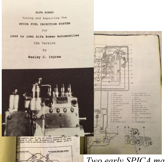
Two early SPICA manuals, one early edition Wes Ingram, the other factory(?) $50 each

See the photos, below. There are more items available.