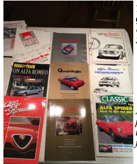
Three copies of the Quadrifoglio, Alfa's U.S. house organ, $30 for the lot

Alfa Indy Car race poster in great condition but with junk frame, $25.00