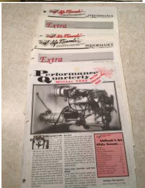
Several copies of the Performance Quarterly, published by Alfa Ricambi. Offers accepted.