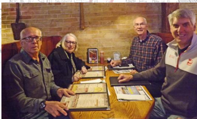
Lunch group at The Mine Shaft