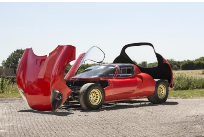
Semi-finished example on a Chevron race chassis

The composite panels are being produced from molds made by copying an aluminum Stradale Prototipo body that one of Norris's U.K. customers commissioned for his use. That body was produced in Italy on the same bucks as the original. The resultant body kit is faithful in shape and proportion to the original. Since they are based on being the Stradale prototype, they differ in some details from the production models.