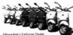
Milwaukee's Exclusive Dealer