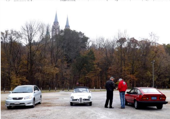
Participants gather at Holy Hill.

On a cloudy but bright Saturday, AROC-Wisconsin held its Fall Color Tour. The route wound for over 60 miles through Washington and Dodge counties, providing plenty of scenery and roads for enthusiastic driving.