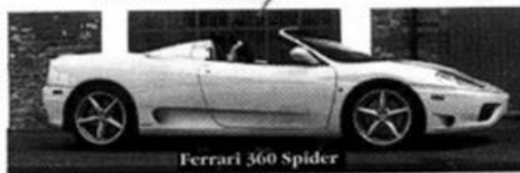
Ferrari 360 Spider