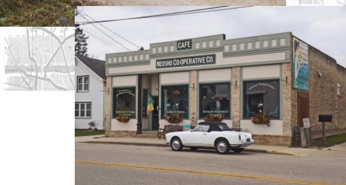
Monches Farm (above) and Neosho Co-op