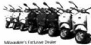
Milwaukee's Exclusive Dealer