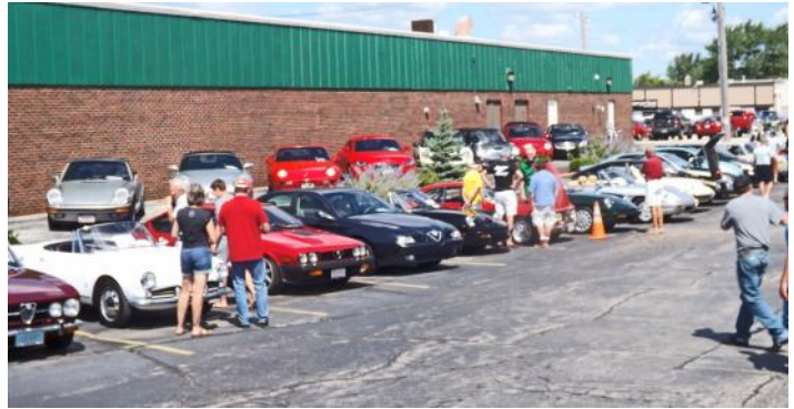
Alfas on display