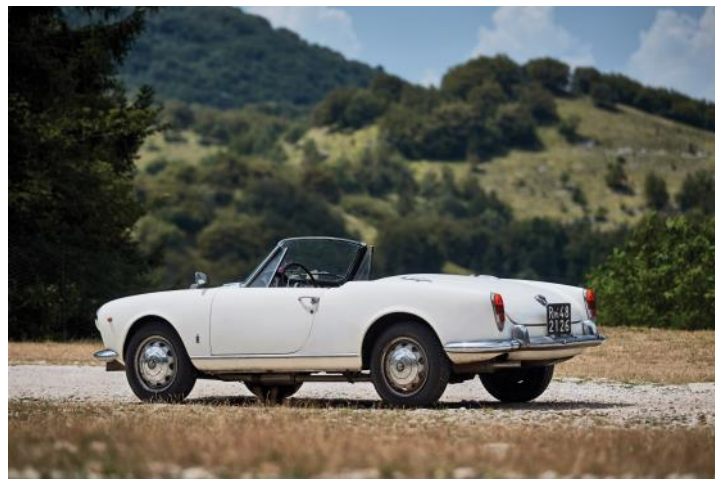
Cymon Taylor © 2016 Courtesy RM Sotheby's

original hardtop was presented in as-used condition, with dented rear bumper, rusty chrome, and general wear from regular use. Having spent its entire life in Italy, the Spider also had a movie credit, with an appearance in the 2003 Italian film The Best of Youth . The car looked complete and ripe for a restoration, or perhaps just a careful clean-up and preservation—tough call. It sold for a strong $72,800.