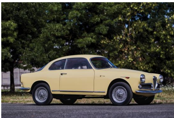
Cymon Taylor © 2016 Courtesy RM Sotheby's

The 1961 Giulietta Sprint is a case study in wheeling and dealing and how it can go wrong. The car itself is a nice looking Sprint done up in a light yellow shade, not the original red, but supposedly the as-found color. It sports chrome Borranis and has nicely done red leather upholstery. The engine compartment is tidy, and only a few minor defects can be seen in the auction company's pictures. Overall it looks like a desirable car. The Sprint started its life after delivery to the Swiss Alfa vendor in 1961. Fast forward to 2015 when it entered restoration as a barn find, to exit complete from an Italian shop in 2016. (If only my own restoration projects could finish that quickly!)