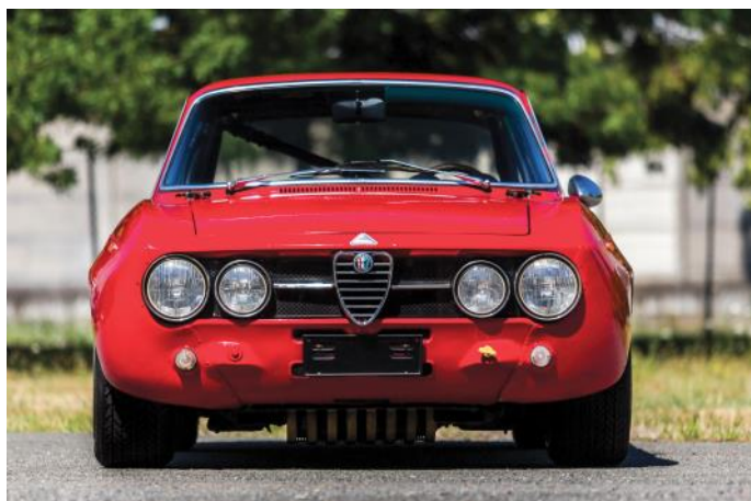
Cymon Taylor © 2016 Courtesy RM Sotheby's

enance was claimed only for the motor, so one can presume there might not have been anything there to talk about.