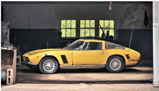
Yellow and rust barn-find ISO

RM Sotheby's held its tenth annual London sale on September 7, 2016. Eighty-six vehicles were offered, producing over $29 million with a 76% sales rate. The organizers were understandably pleased with the results, calling the auction "a game-changer," citing the enthusiasm in the room as a sign of an improvement in the European market. The top sale was a 1960 Aston Martin DB4GT—one of 75 which sold for $3.195 million. A brace of eight primo Porsches produced an aggregate $6.14 million, and a tatty yellow-and-rust "barn-find" Iso Grifo with an auction estimate of $39,000–$65,000 sold for $166,400. There were seven Alfas in the sale, with one—a 1939 6C2500 Cabriolet—posting the fifth-highest sale at the auction at $1.238 million.