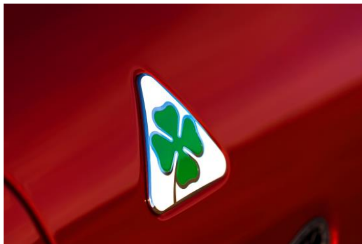
The quadrifoglio adorns the flanks of the new Giulia