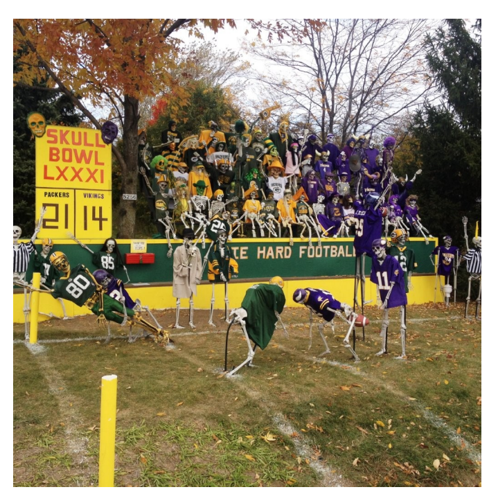
Gary saw this on Hwy 167 enroute to the Color Tour.