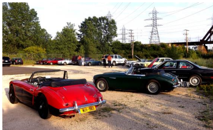
More of the cars in attendance.