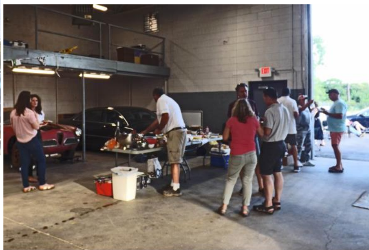
The food was plentiful.