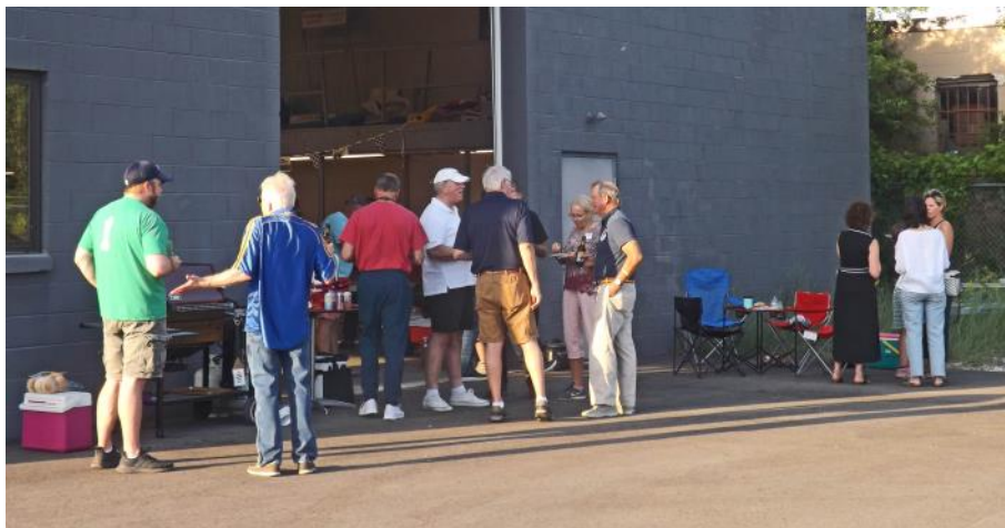
The attendees enjoyed the fine weather.