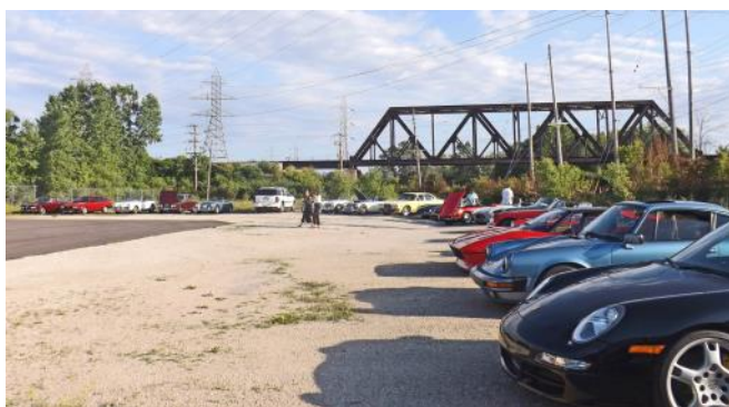
Many cars were on exhibit.