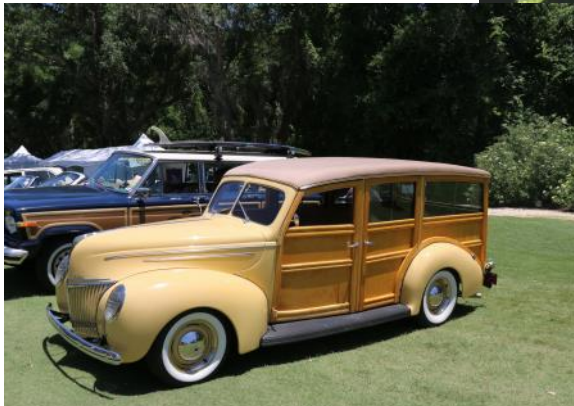
Tom Cotter's Woodie