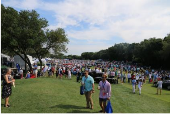
Sunday's crowd on the show field