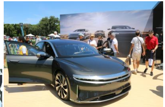
The Lucid Air is designed in California and made in Arizona. Order it online. Thoroughly modern. Starts at $69,900, with tax credit.