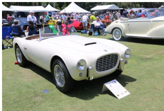
This 1953 Siata 208S was powered by a Fiat tipo 103 Otto Vu engine. It later received a small block Chevy, but returned to Fiat V8 power upon restoration.