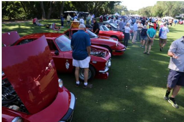
Alfas lined up during Saturday's Cars & Coffee.

All things considered, it was a fine trip. The weather was perfect and the automotive sights were impressive. Our non-automotive adventures were also very satisfying. Our visit to the Cumberland Island National Seashore was a great way to spend an afternoon amid nature, and the Riverview Hotel in St. Mary's was a quaint and comfortable place to stay. 🍀