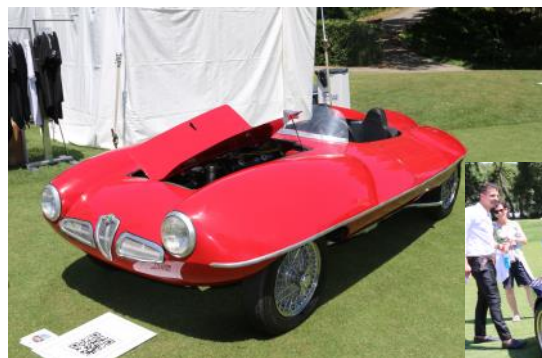
Old vs. new. Disco Volante and GTelectric were quite a pair.