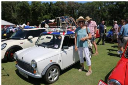
Very little doubt as to where Chrystal's interests lie.