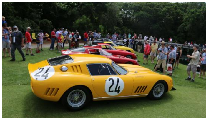
A strong-voiced Tifosa managed to get everyone clear of this line-up of 275GTBs so I could get this picture.