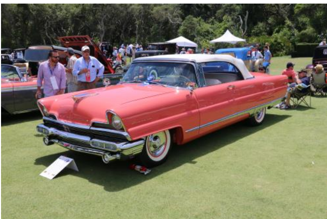
A 1956 Lincoln Premier convertible looked smart in Salmon.