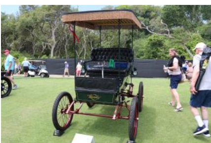
A 1901 Waverly was representative of the electric car's first generation.