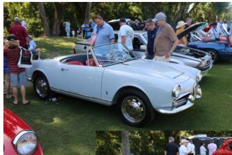
Spiders ranged in age from this very nice Giulia Spider Veloce...