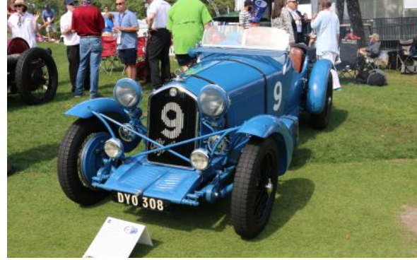
This Brianza-bodied 1934 8C2300 is said to be that year's LeMans winner with drivers Luigi Chinetti and Phillip Etancelin on board.