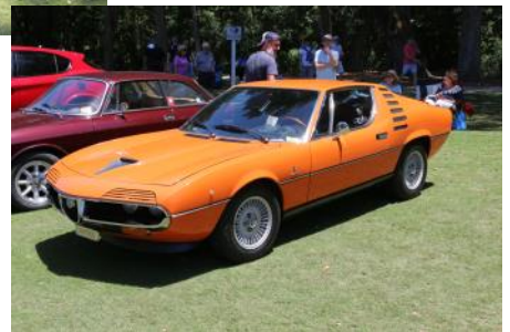
Delmas Greene's clean Montreal