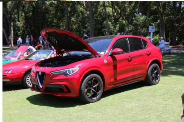
A Stelvio Quad among the "classics"