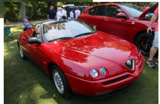
...to this sparkling red late-nineties 916 series Spider from Georgia, imported some years ago from Canada.