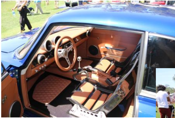
More of the GTelectric prototype.