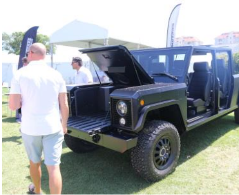
This boxy truck from Bollinger Motors is electric and unique, with a straight-through cargo bay. Hauling telephone poles?