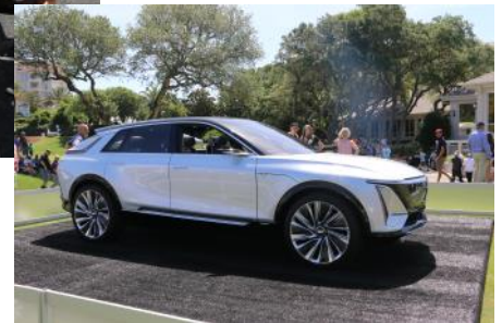
Cadillac's Lyric is large and in charge