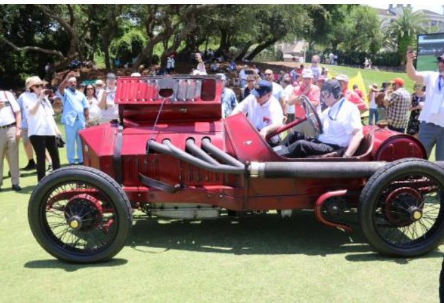
Spectators got a good 20 minutes of entertainment watching a crew of five attempting to start this 1913 Isotta Fraschini Tipo IM. One fellow set his gloves on fire spraying starting ether and gasoline. Cheers arose as the car finally roared to life. The sound of the open exhaust was deafening. No one could hear the award presentation.