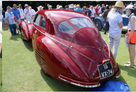
A 1939 8C2900B Berlinetta was entered by Brian and Kimberly Ross of Ohio. The triple rear window identifies it as chassis 412024, purchased at auction in 2019 for just shy of $19 million.