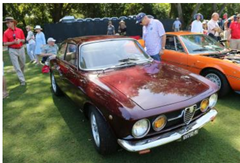
A very nice 1969 GTV