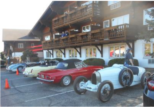
The best of Britain, France, and Italy (B. Siegfriedt)