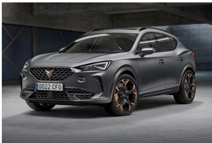
The Cupra Formentor

overall scores. While the Alfas scored highly in design, they were not ranked in the top ten for quality in either category. Audi took top marks for quality in both classes. Both the Giulia and Stelvio were rated 9th overall in their respective classes. The Cupra Formentor (Some name!) was first overall in mid-class SUVs and the Skoda Superb placed first in sport sedans. Cupra is the performance badge of the Spanish automaker SEAT, while Skoda is a venerable Czech marque. Neither can be found in the U.S. 🍀