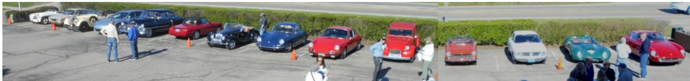
The Chalet Landhaus parking lot filled up quickly.