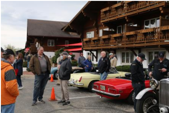
Saturday morning in the parking lot