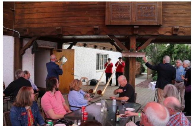
An Alpenhorn duet calling us to dinner?