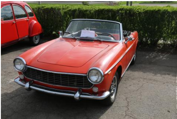
The Anding's Fiat 1500 is a perennial entrant.