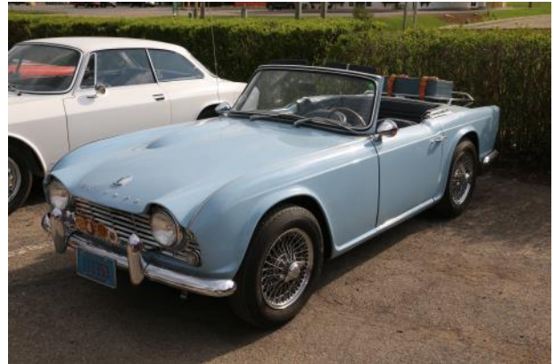
We're not sure who brought this nice TR4.