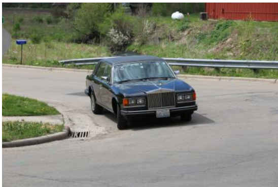
Not too sporty, but fast and comfortable—John Koziol Jr’s “Roller.”