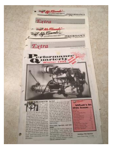
Several copies of the Performance Quarterly, published by Alfa Ricambi. Offers accepted.