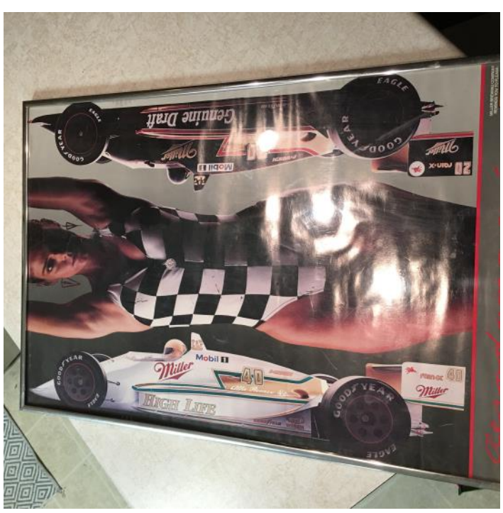
Alfa Indy Car race poster in great condition but with junk frame, $25.00