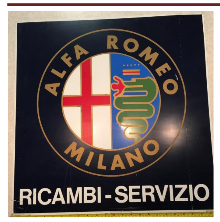
Reproduction of an Alfa parts and service sign, 24"x24", $50.00