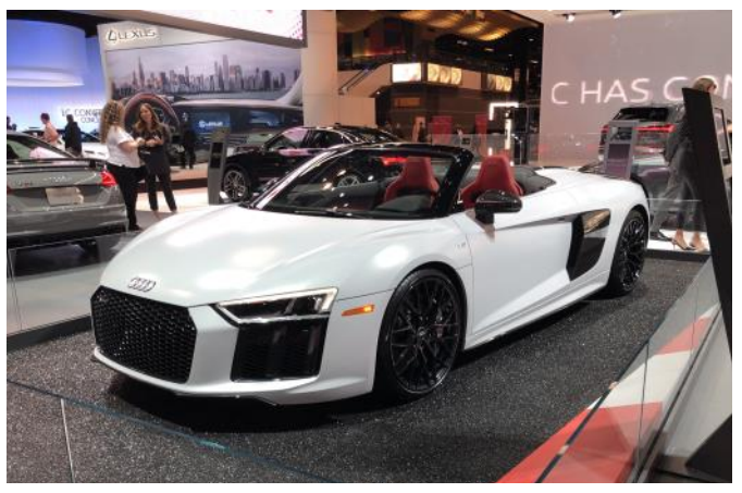
Audi R8 V10 Spyder

Elsewhere on the floor, Acura commemorated the 30th anniversary of the NSX, Ford displayed its GT alongside the 2020 Shelby GT500, and Audi showed the latest version of the R8.