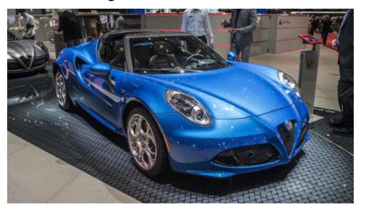
The 4C Italia as shown at Geneva in 2018. I somehow managed to miss shooting a picture of it in Chicago.

In past years, Alfa emphasized its heritage, displaying a Tipo 33 Stradale, and inviting styling comparisons with the 4C Coupe. This year the marque displayed last year's Sauber-Alfa Formula 1 car, but it was sited toward the back of the booth, out of the way from the bread-and-butter Stelvios and Giulias. The space was all about selling these cars.