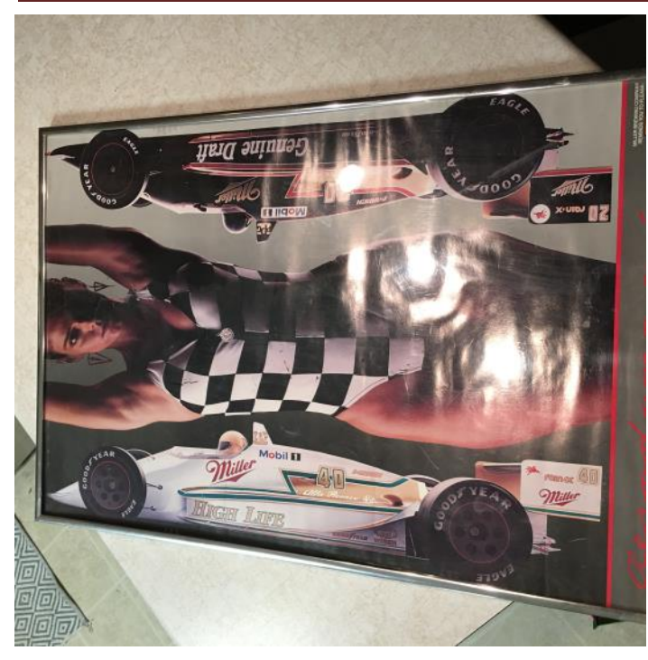
Alfa Indy Car race poster in great condition but with junk frame, $25.00