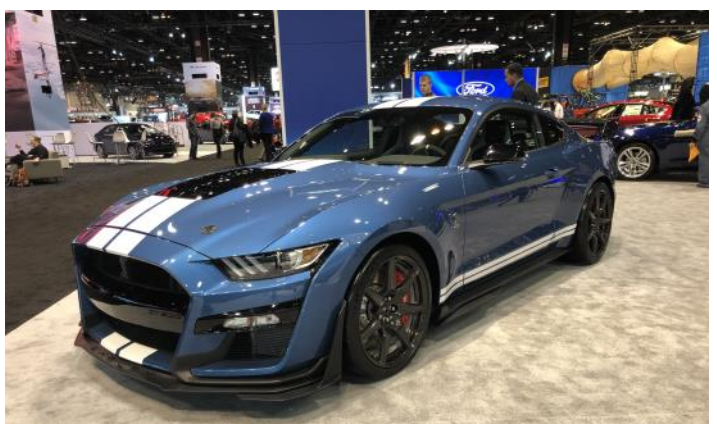
Ford's latest Shelby GT500. Look but don't touch, for now.