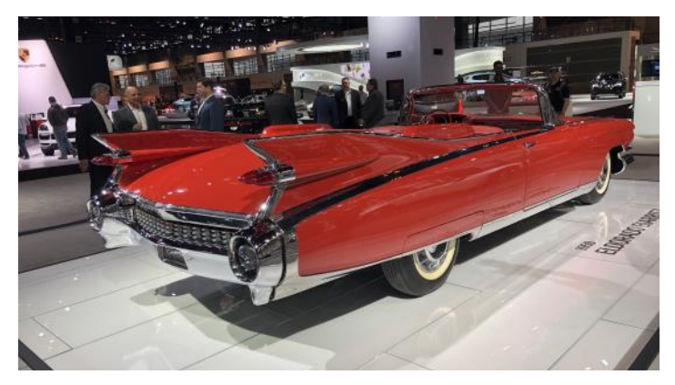
Fins anyone? The Biarritz had them in spades.

The prize for the most impressive centerpiece goes to Cadillac. It displayed a glowing 1959 Eldorado Biarritz Convertible in all its fully-finned 20 foot glory. They don't make 'em like that anymore, for sure. The car comes from GM's own collection. They've owned it since new. It was backed by copies of the current CTS-V and the ATS-V performance sedans.