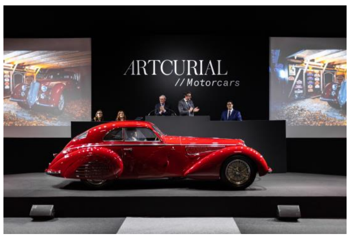
8C2900B Lungo Touring Berlinetta at Artcurial

After passing through the hands of a few British owners, the car came into the long-term ownership of a Dutch collector family. The consigning owner was present when his father purchased the car for €11,000 43 years ago. The car has never been comprehensively restored, although it has been repainted and slightly modified over the years. It was used as a daily driver for a period of time and has enjoyed continual maintenance and use. The car joins the three other Touring Berlinettas in the U.S., two of which have won the top award at Pebble Beach.