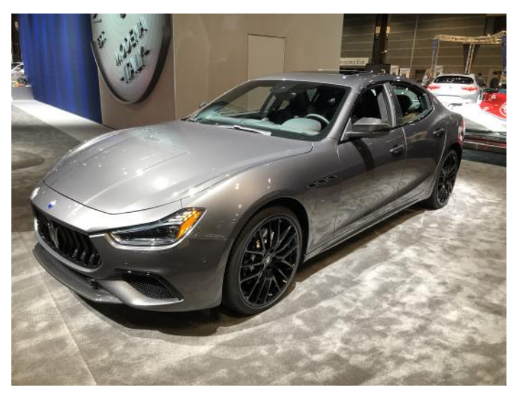
Ghibli Sport edition has distinctive air dams and rear spoiler, blackout wheels, fewer "driver aids" than the Lusso edition which has more chrome

clude distinctive front and rear treatments and specific option packages intended to satisfy a broad range of customers interested in buying a car "off the lot."