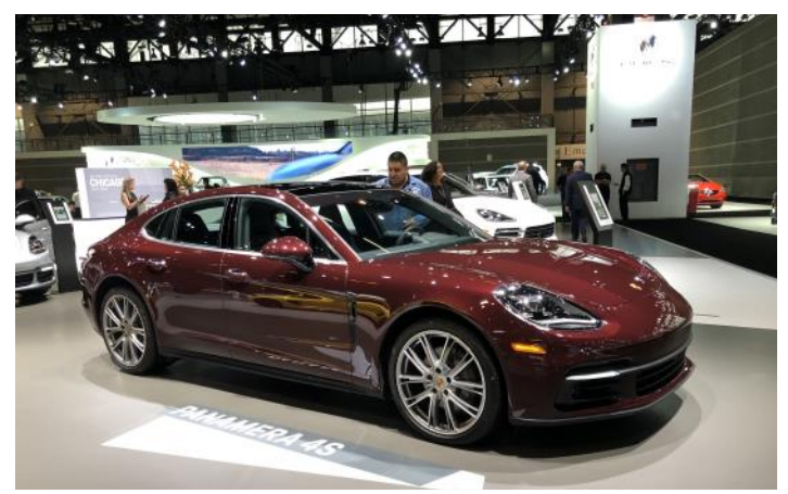
These Panameras seemed much better looking than the first generation.

Porsche, Audi, and VW were the only German manufacturers at the show. Mercedes and BMW were conspicuous by their absence. Porsche displayed three different performance levels of Panamera—hot, hotter, and hottest. While on the stand, I poked my nose into the Macan on display and was reminded of the criticism Alfa received about the switchgear on its early 164 dashboards. The Macan's console has more switches than the stops on the average theater organ. Drivers must take a bit of time to acclimate.