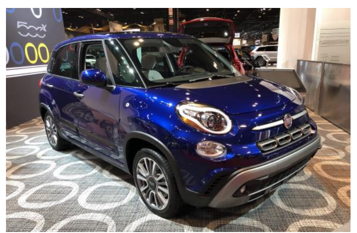
I thought this paint treatment made the 500L look less ozzie, but that was offset by the new snout.

Fiat was lodged in the FCA space, wedged in between the Dodge boys and Jeep. There are some facelifts in the line and 500s now come equipped with a 1.3 liter turbo engine making more horsepower than either of the previous options. Nothing else going on there.