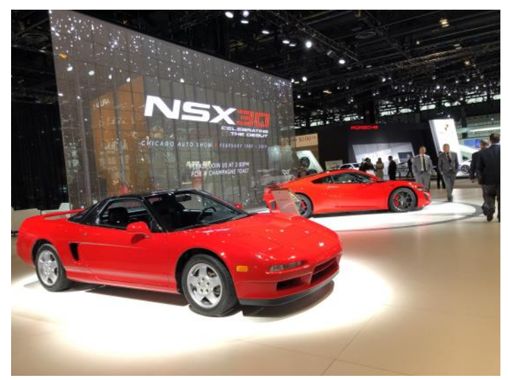
Thirty years after the first NSX reveal, Acura commemorated it with a champagne toast and, of course, the new NSX.