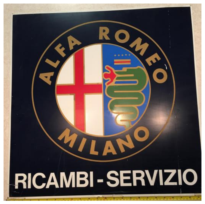
Reproduction of an Alfa parts and service sign, 24"x24", $50.00