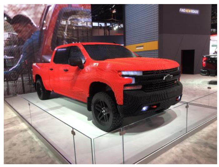
Chevy's Lego Silverado-how do they do it?

SUVs and trucks were everywhere and held pride of place in most manufacturers' spaces. Perhaps the most unique pickup displayed was a full sized model of the Chevrolet Silverado constructed entirely of Legos.