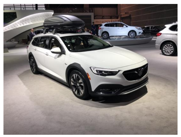
My favorite Buick. The Regal TourX might be a bar gain version of the BMW Sportwagen.

If you want a Buick sedan, you will be buying a Regal in one of a number of configurations. There are no others being produced. Of course Buick SUVs are plentiful, or you could buy the Chevrolet, GMC, or Cadillac versions. Most of the platforms are the same.