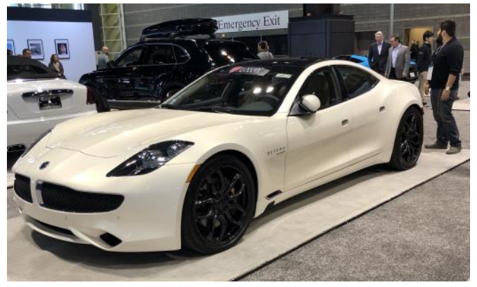
Good Karma? They hope so. The Karma Revero hybrid is an updated Fisker Karma.