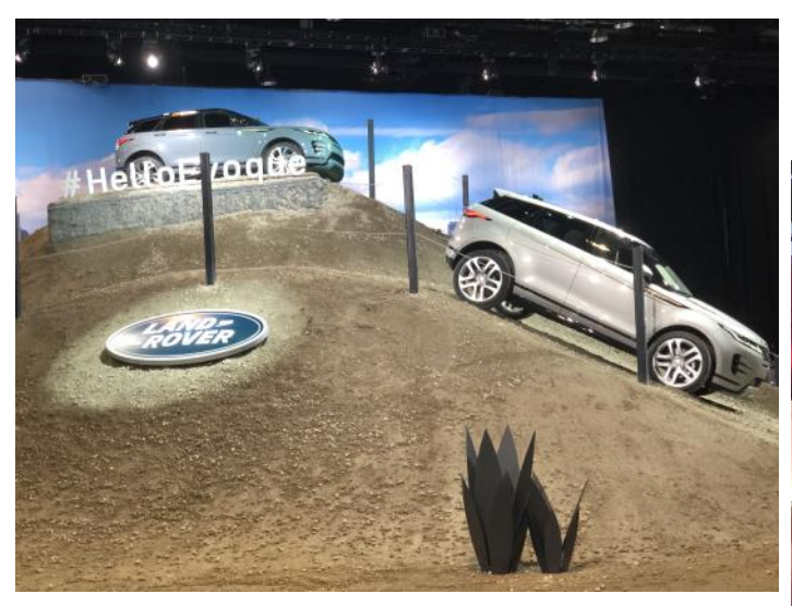
The Land Rover Evoque reveal was a big deal, complete with snacks, entertainment, and industry bigwigs.

Jaguar - Land Rover made a big splash with the premier of the redesigned 2020 Land Rover Evoque compact SUV, while its Jaguar I-Pace electric SUV was named Motorweek Best of the Year. With distinctive styling, a 238-mile range and front and rear motors that can propel the sport-ute to 60 mph in 4.2 seconds, the I-pace will certainly make its mark.