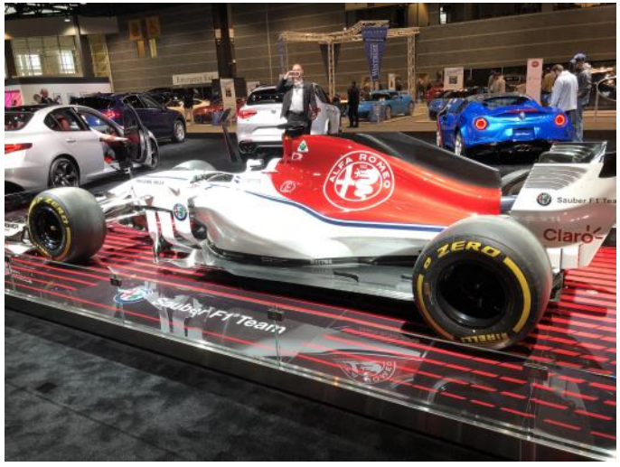
The 2018 Sauber C37 Alfa-Sponsored F1 car as seen at the Chicago Auto Show

In late January the Sauber - Alfa Formula One team formally announced that it has entered the 2019 formula one season as Alfa Romeo Racing.