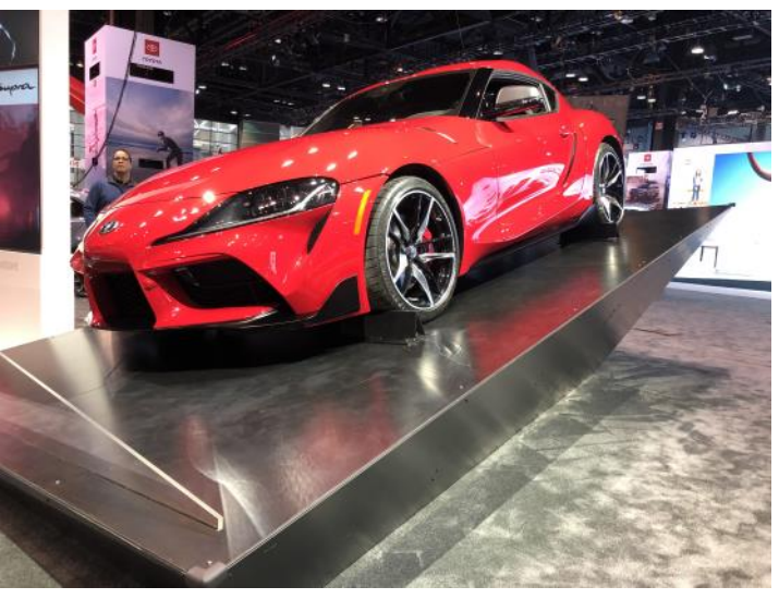
Toyota showed its new Supra, the only BMW at the show. (It shares an awful lot with the Z4.)