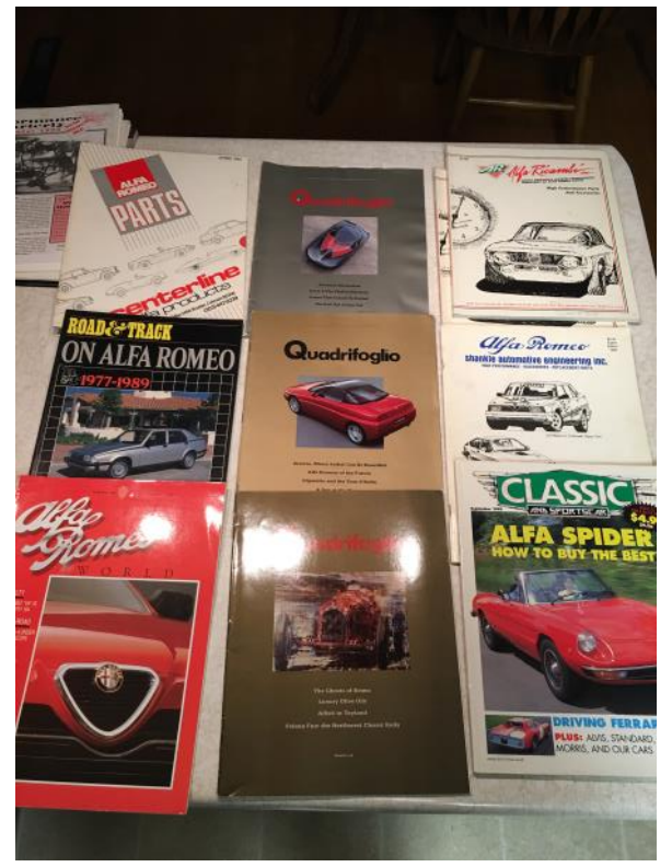
Three copies of the Quadrifoglio, Alfa's U.S. house organ, $30 for the lot

jection manual, some Alfa books, and the special 60th anniversary Pininfarina book. I was hoping to sell them as a single lot but may consider breaking it up.