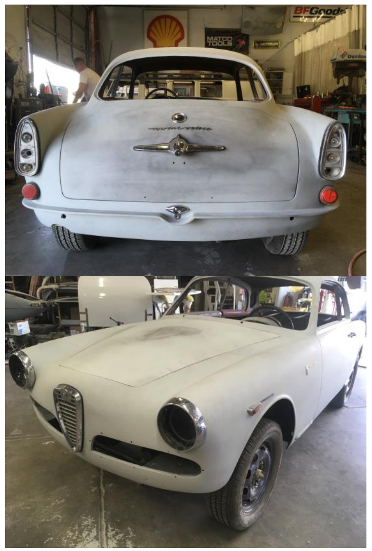
The Sprint six years later, now in primer