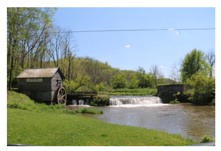
Hyde's Mill is a hidden treat along the route. Other surprises included an entire disused kiddy park and railroad in a farmer's field. (Sorry, no picture.)