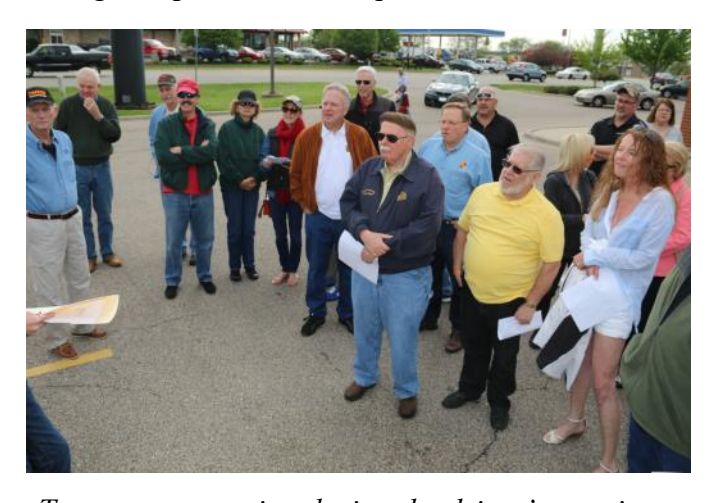
Teams pay attention during the driver's meeting.

Enthusiasts of every stripe converged on Beloit on a partly cloudy Saturday morning. The field included Porsches, Corvettes, Ferraris, Jaguars, Loti, and at least three Alfas. After a brief driver's meeting we were off on a 190 mile jaunt over the county and rural roads of South Central Wisconsin. The skies quickly cleared and we spent a glorious Saturday, with stops at Nick's Grandview Folk Art Environment and Tower Hill State Park. Lunch in Dodgeville and dinner in Stoughton provided the requisite sustenance.