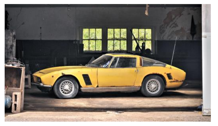
Yellow and rust barn-find ISO

RM Sotheby's held its tenth annual London sale on September 7, 2016. Eighty-six vehicles were offered, producing over $29 million with a 76% sales rate. The organizers were understandably pleased with the results, calling the auction "a game-changer," citing the enthusiasm in the room as a sign of an improvement in the European market. The top sale was a 1960 Aston Martin DB4GT—one of 75 which sold for $3.195 million. A brace of eight primo Porsches produced an aggregate $6.14 million, and a tatty yellow-and-rust "barn-find" Iso Grifo with an auction estimate of $39,000–$65,000 sold for $166,400. There were seven Alfas in the sale, with one—a 1939 6C2500 Cabriolet—posting the fifth-highest sale at the auction at $1.238 million.