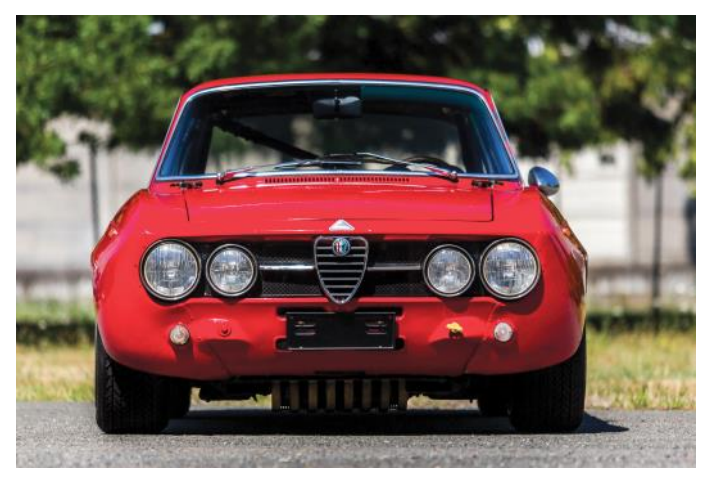
Cymon Taylor © 2016 Courtesy RM Sotheby's

enance was claimed only for the motor, so one can presume there might not have been anything there to talk about.