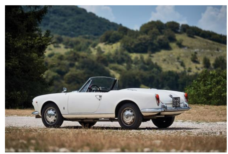
Cymon Taylor © 2016 Courtesy RM Sotheby's

original hardtop was presented in as-used condition, with dented rear bumper, rusty chrome, and general wear from regular use. Having spent its entire life in Italy, the Spider also had a movie credit, with an appearance in the 2003 Italian film The Best of Youth . The car looked complete and ripe for a restoration, or perhaps just a careful clean-up and preservation—tough call. It sold for a strong $72,800.