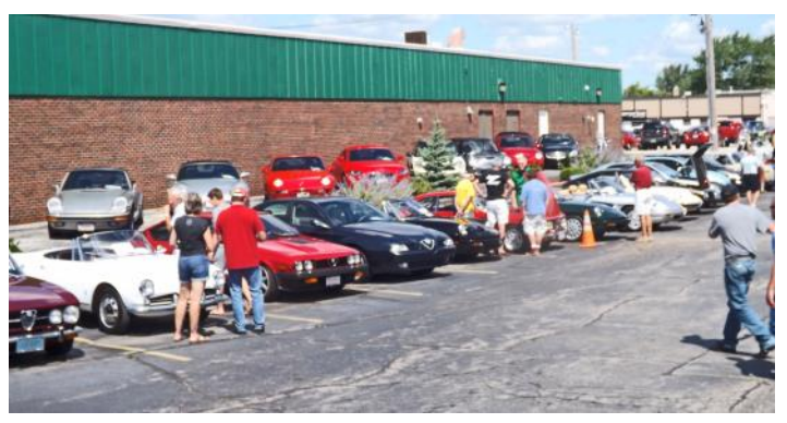
Alfas on display