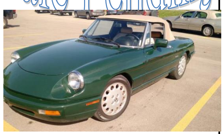
1987 Alfa Romeo Spider Quadrifoglio

It is a nice driving car and I always get compliments on it. That said, it is not in show car condition. It has just under 90,000 miles on it. I am asking $6,700 or best offer. Located near Ridott, ID 61067. Text or call 815-821-1329 for more information. Kathleen Mason