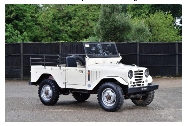
Tim Scott © 2016 Courtesy RM Sotheby's

First up was a white 1952 AR51 1900M "Matta" reconnaissance vehicle. Alfa produced 2,050 of these Italian Jeeps, 2,000 for the government and another 50 for civilian consumption. According to the auction