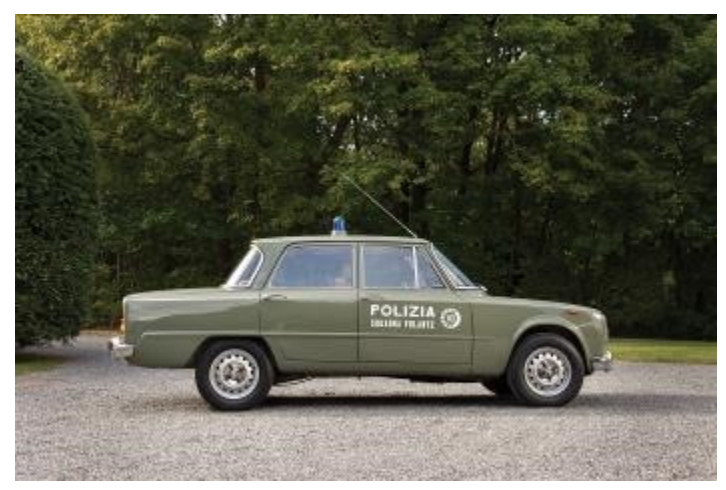
Will the Italian tax laws result in more imports like this?

Last year a revision of the auto registration laws in Italy extended the tax requirements to cars up to 29 years old. Prior to that, cars older than 20 years were tax exempt. According to the Blasting News article, this has led to a reduction in business for body shops and classic car restorers due to the reluctance of their owners to keep older cars on the road. Owners now find themselves liable for up to an extra €1,500 tax per car on their collections. Although there have been protests, it doesn't seem that the government is likely to grant any waivers or make any changes to the law. This could mean that there will be an outflow of certain cars from Italian collections. The author states that the most popular collector cars in Italy are Alfa Romeo, Lancia, and Ferrari and fears that many may flow out of Italy as a result of the added tax burden. What's bad news for Italian collectors might be good news for enthusiasts in other parts of the world, including the U.S.