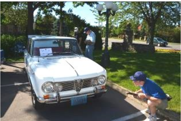
My Super being judged in Toronto