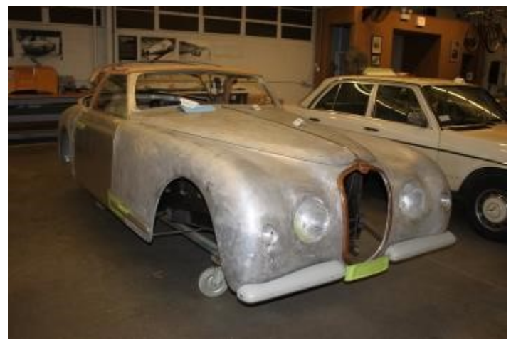
One of two one-off 6C2500s being restored at Cooper Technica